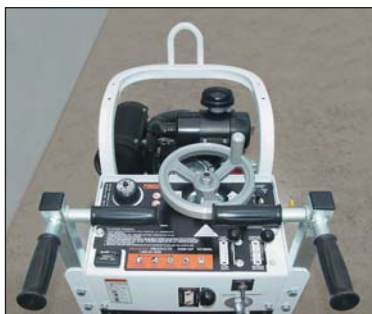
Handles may be mounted pointing in (shown) or out